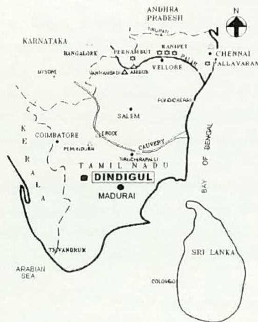
Figure 1: Study Area

The objectives of the study is to isolate the chromium tolerant bacterial strains from the tannery effluent, and to measure minimum inhibitory concentration of six bacterial strains that can be used for bioremediation process.